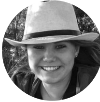
JOBİ ROEMER YOUTH TOUR