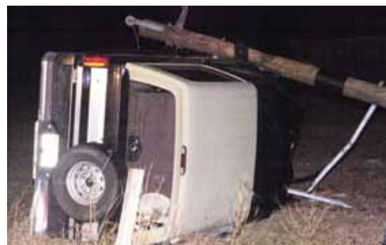
The teens in this car crash knew to stay in the car until the power lines that had fallen were de-energized, thanks to a demonstration by their local electric cooperative.

In the vast majority of those incidents, the safest place to remain is inside the car. Only in the rare instance of fire should people exit a vehicle. Then, they must know how to do so safely, jumping free and clear, landing with feet together, and hopping away. It's difficult to get out without creating a path for current to flow, which is why one should get out only if forced to.