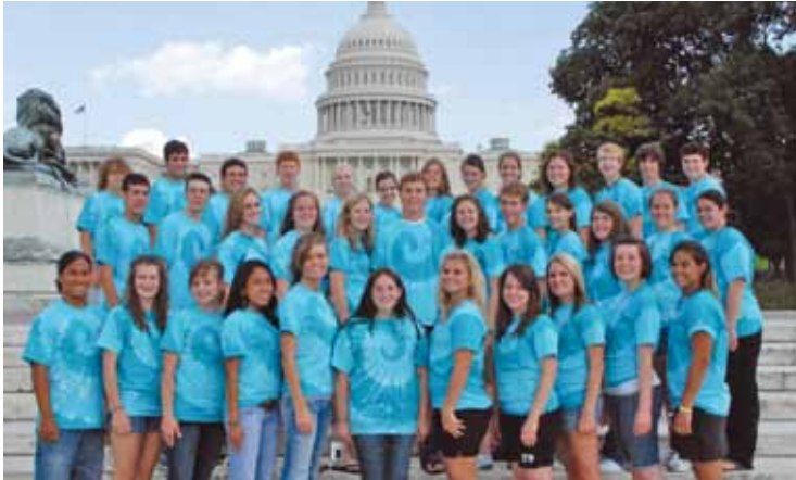
Kansas Youth Tour delegates from 2009.