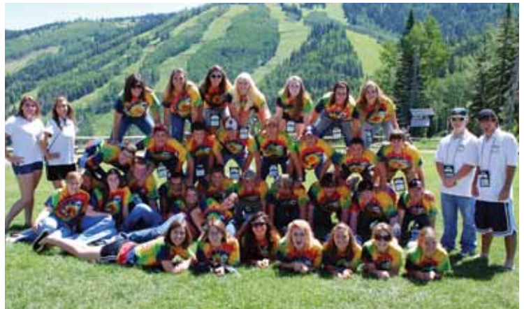
Kansas' 2009 campers build a human pyramid on Mt. Werner.

Lane-Scott Electric Cooperative will be offering free trips for up to four children of Lane-Scott Electric members.