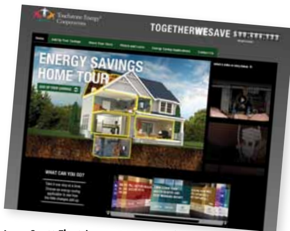
Lane-Scott Electric encourages you to see how making little changes can add up on your electricity bill by visiting www.TogetherWeSave.com .

The Virtual Home Tour provides a good starting point. As you move through each of